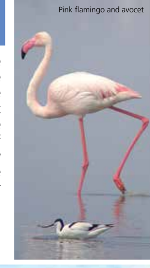
The "Sansouire" (saltwort plains)

The Camargue National Preserve was created in 1927 by the French National Society for Nature Protection, in order to protect plant and animal species. The Preserve covers 13,117 ha, of which a large part is occupied by the Vaccarès Pond. La Capelière is a tourist information center managed by the National Preserve. You will find there discovery trails, exhibitions, documents.