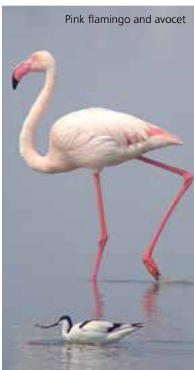
Pink flamingo and avocet

The Camargue National Preserve was created in 1927 by the French National Society for Nature Protection, in order to protect plant and animal species. The Preserve covers 13,117 ha, of which a large part is occupied by the Vaccarès Pond. La Capelière is a tourist information center managed by the National Preserve. You will find there discovery trails, exhibitions, documents.