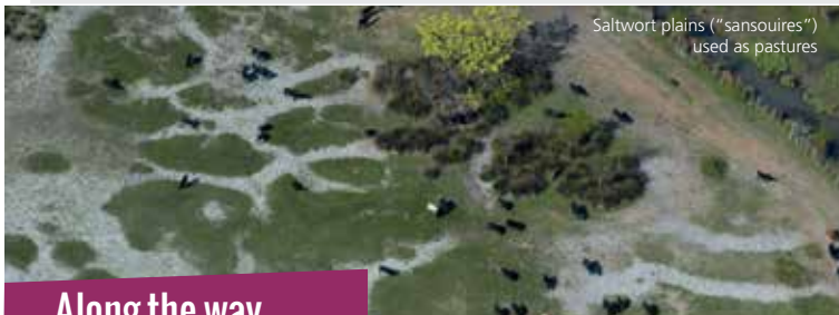
Saltwort plains ("sansouires") used as pastures