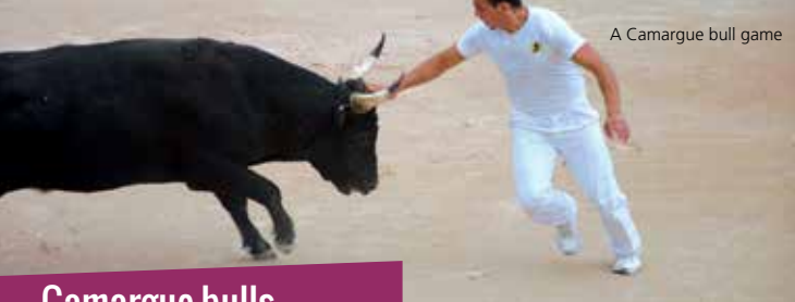
A Camargue bull game