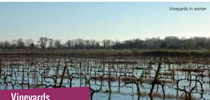
Vineyards in winter

The Santiago-de-Compostela pilgrimage route is a reminder of the apostle James (alive at the time of Christ) who is supposed to have been beheaded around 41-44 AD. His tomb was discovered during the reign of Charlemagne and Alphonse II the Chaste (759-842). This route attracts numerous pilgrims. The "Via Tolosana" that starts in Arles is one of four routes through France to James' tomb.