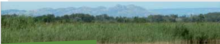
The Capeau swamps