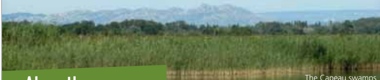
The Capeau swamps