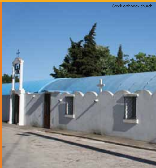
Greek orthodox church

Start from the Tourism Office in Salin-de-Giraud. In the village at the red light go straight ahead then take the first right toward the city center. The Tourism Office is located on rue Tournayre, 150 m before the arena..