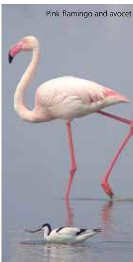
Pink flamingo and avocet

The Camargue National Preserve was created in 1927 by the French National Society for Nature Protection, in order to protect plant and animal species. The Preserve covers 13,117 ha, of which a large part is occupied by the Vaccarès Pond. La Capelière is a tourist information center managed by the National Preserve. You will find there discovery trails, exhibitions, documents.